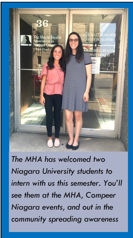
The MHA has welcomed two Niagara University students to intern with us this semester. You'll see them at the MHA, Compeer Niagara events, and out in the community spreading awareness