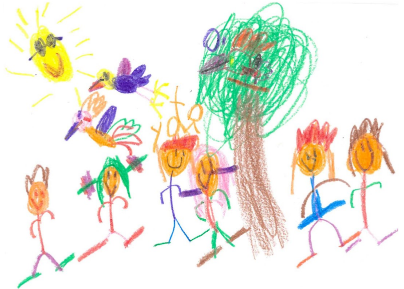
Picture drawn by a child in the In-Home Respite Program.